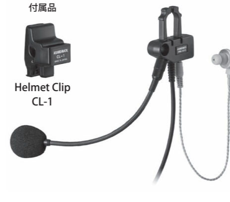
付属品 Helmet Clip CL-1