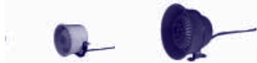
DH-35 耐候性パツフル付スピーカ