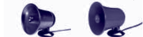
RUH-5 レフレックスホーン