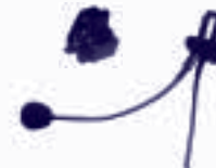
HRM-301 HRM-301D (付属品:ヘルメットクリップ)