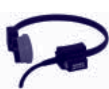
咽喉マイク JM-710-01 (オプション:PR-17)

騒音化での通話に最適な咽喉マイクを始め、通信販売の電話オペレーター、工事現場、イベントなどの通信機器に最適なヘッドセットです