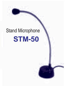
Stand Microphone STM-50